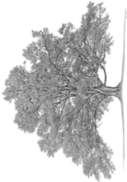
Sample tree type (Little to no leaves)

Do 2 versions 1 in color and 1 in black & white